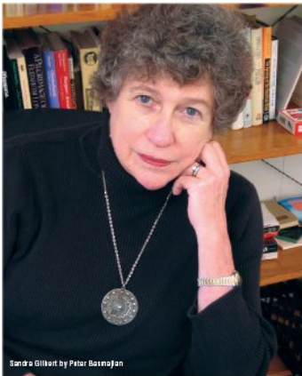
Sandra M. Gilbert, Ph.D.