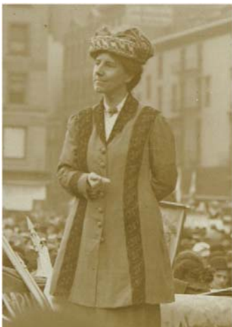
Charlotte Perkins Gilman

The 50 th anniversary of the MWWC is the perfect goal for the completion of a long contemplated MWWC documentary film. This resource will document the history of the Collection and its activities.