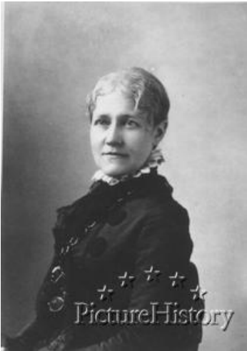
Harriet Prescott Spofford