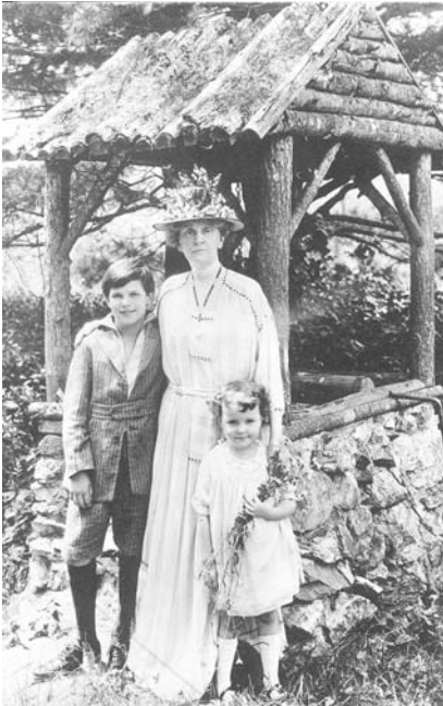
Kate Douglas Wiggin with children