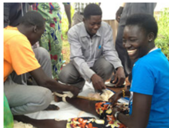
A light-hearted moment.

Many people have asked us, "Why South Sudan?" South Sudan is the newest country in the world with a population of over 8 million and a landmass the size of Texas. Its medical needs are great, as the country has limited health infrastructure and no more than 250 physicians practicing in country. The River Kit Region, in particular, is the former home of many refugees who have resettled