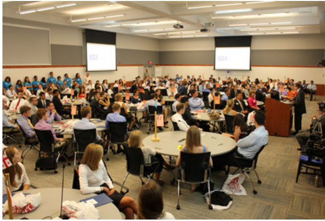
The Class of 2017 at Orientation in the new Decary Annex classroom

We look forward to having the new medical students and the teaching faculty use this facility and evaluate it. Most likely some changes will be necessary, but I predict that as we move along both the first and second year students and faculty will be impressed by the new facility and the learning opportunities therein.