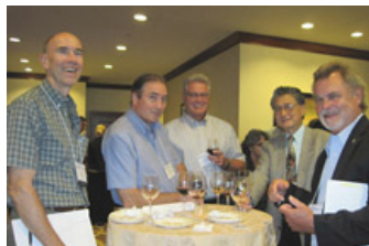
Former UNECOM Alumni and friends catch up for a laugh.