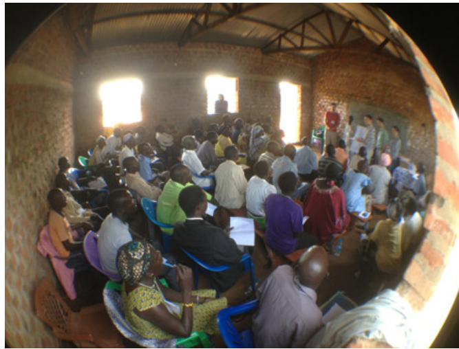
Discovering the value of Osteopathic Manipulative Treatment