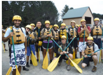
Class of 2017 Rafting Trip

On July 31st, 177 new students joined the COM community for Day 1 of Orientation. The beautiful, sunny weather matched the moods of all involved as we excitedly welcomed the Class of 2017 to campus with an outdoor lunch, followed by an introduction to the brand-new Decary Annex classroom, constructed specifically for this class of students. 45 second-year students, known as Orientation Leaders (or OLs), were decked out in teal blue t-shirts (easy to spot!) and enthusiastically led groups of incoming students around campus for the three days of Orientation, answering their questions and helping to orient them to their new lives as COM first-years.