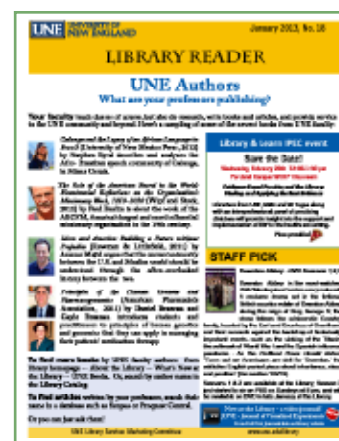
Available online, click image to access

Published January 2013 edition of Library Services' newsletter, Library Reader , featuring UNE Authors