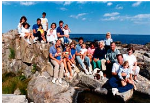
Bush Family at Walker's Point

George & Barbara Bush Legacy Collection exhibit: “Family First for a First Family”