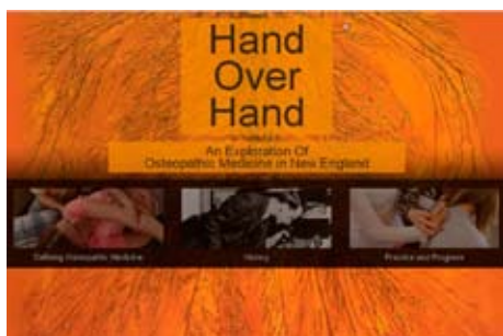
Entry page to the online film

New England Osteopathic Heritage Center film available online: “Hand Over Hand: An Exploration of Osteopathic Medicine in New England”