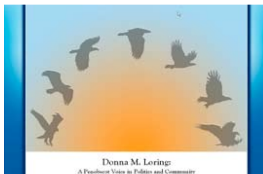
Entry page to the online collection; each eagle is a link

Maine Women Writers Collection new digital collection: “Donna Loring: A Penobscot Voice in Politics and Community”