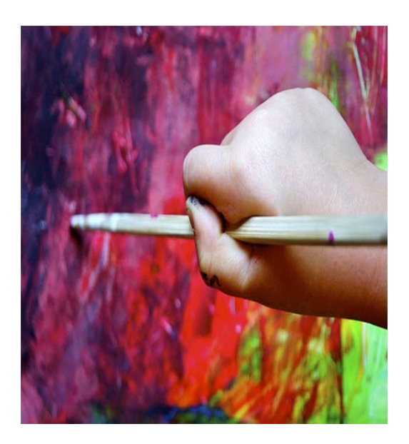
The Adverse Childhood Experiences Study

The ACE study, as it is called, looked at the effects of three categories of adverse childhood experiences in 17,000 Americans.