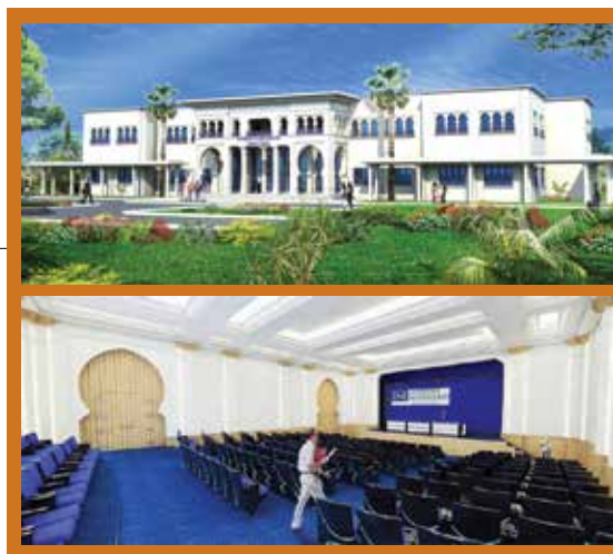
Renderings of UNE's campus in Tangier, Morocco

To your east is the expanse of North Africa and the rest of the Arab world; to your south is the rest of Africa; and to your west is the large Atlantic Ocean ending somewhere near South Carolina. There are no better places on our globe to find such a crossroads of cultures and languages.