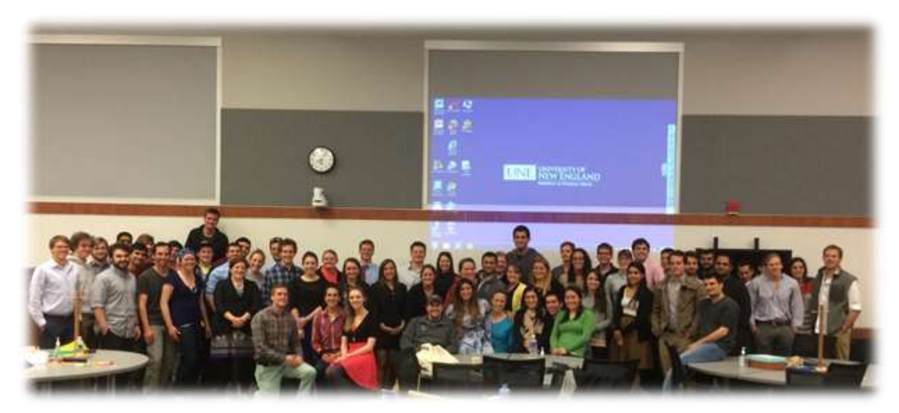
SSP Trivia Night

The event was co-sponsored by Champions Pub of Biddeford, and approximately 75 students, staff, and faculty members participated. The crown of "Trivia Champion" went to a group of students from the class of 2017. SSP will be presenting the Hospice Volunteers of Southern Maine with a check for $200.00.