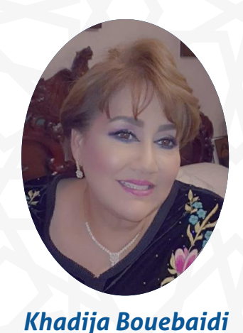
President of the Association La Crèche de Tangier for Newborn and Abandoned Children Tangier, Morocco