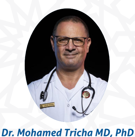
Head of Rehabilitation and Neurosciences Department Rabat, Morocco