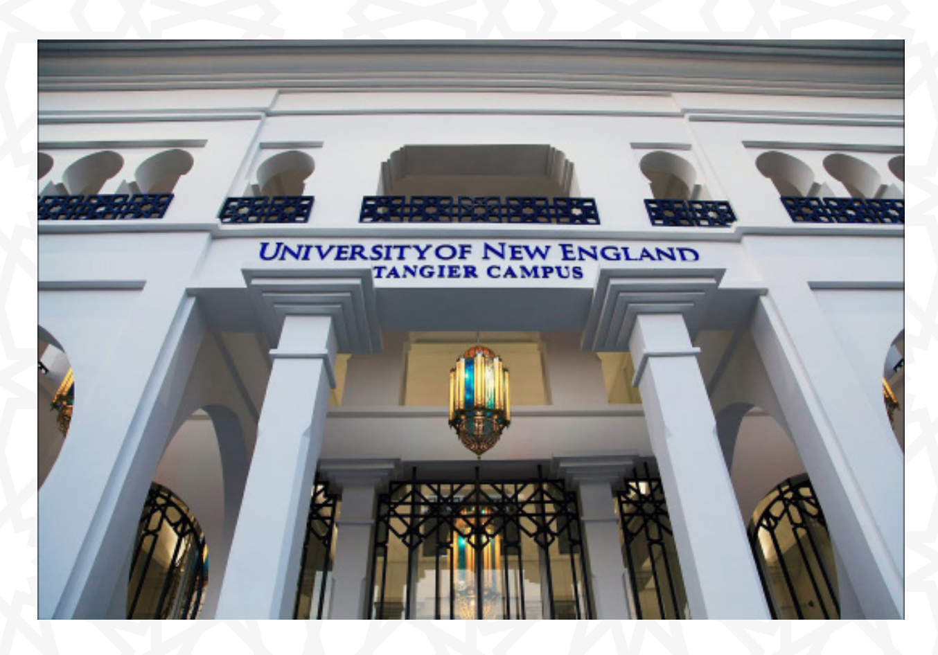
Address: Avenue Abi Chouaib Doukkali, Tangier 90000, Morocco