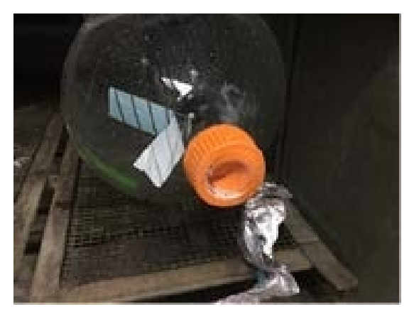
The ruptured bottle cap.