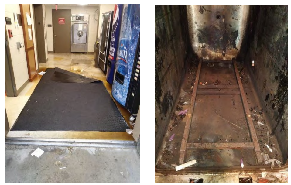
Liquid from biohazardous waste bags sprayed from an autoclave into a hallway at the University of North Carolina, Chapel Hill. A clogged drain/strainer was a partial cause.

During the incident at WCM, a laboratory technician was using an autoclave to sterilize tools and materials. He opened the door after the cycle finished and a bottle inside the autoclave burst. It sprayed him with hot liquid and steam, causing serious burns on multiple areas of his body.