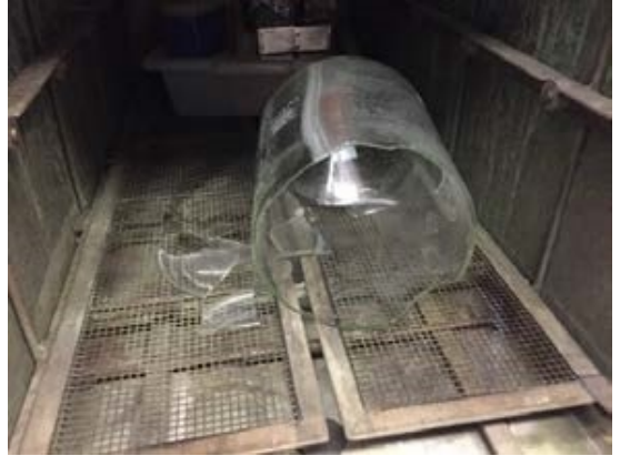
Burst bottle placed directly on autoclave rack.