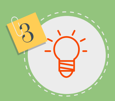
Brainstorm Ideas * Review items in the UNE Green Office assessment tool * Unleash creativity