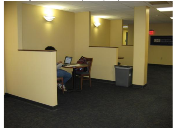
Renovated lower level at Ketchum Library

Phase I of the Ketchum Library Project has been completed. This phase upgraded student study spaces, relocated four library staff offices, constructed five new group study rooms, plus increased and improved the seating space in the Library lower level and the Windward Café. Phase II will begin later in the spring semester and will convert the main entrance of the Ketchum Library to include a new art gallery space and to completely reconfigure the Library entryway.