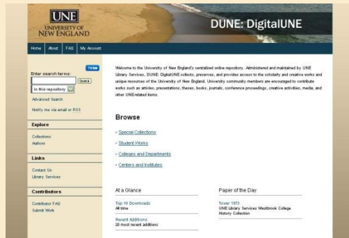
Home page of DUNE website http://dune.une.edu

Report to the Board of Trustees, Nov. 2013