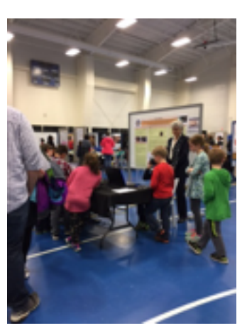
Kids line up at the Brain Fair to try the VR experience.

to demonstrate what they learned and how their perspective on aging had changed through the experience. Results show that this is an effective new learning modality.