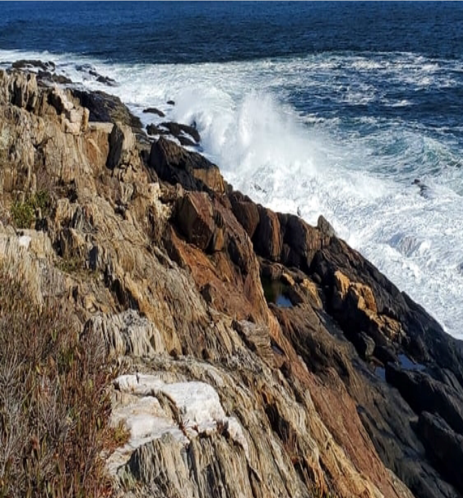
Public Health District 1 YORK

Partners for Healthier Communities at Southern Maine Health Care