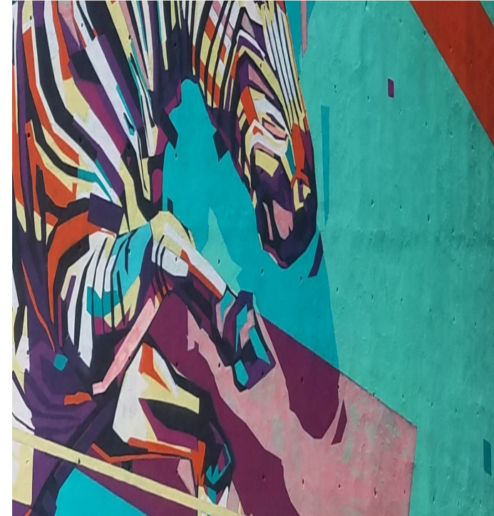
Public Health District 3 WESTERN