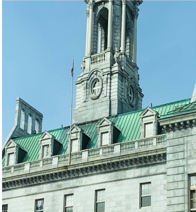
Public Health District 2 CUMBERLAND