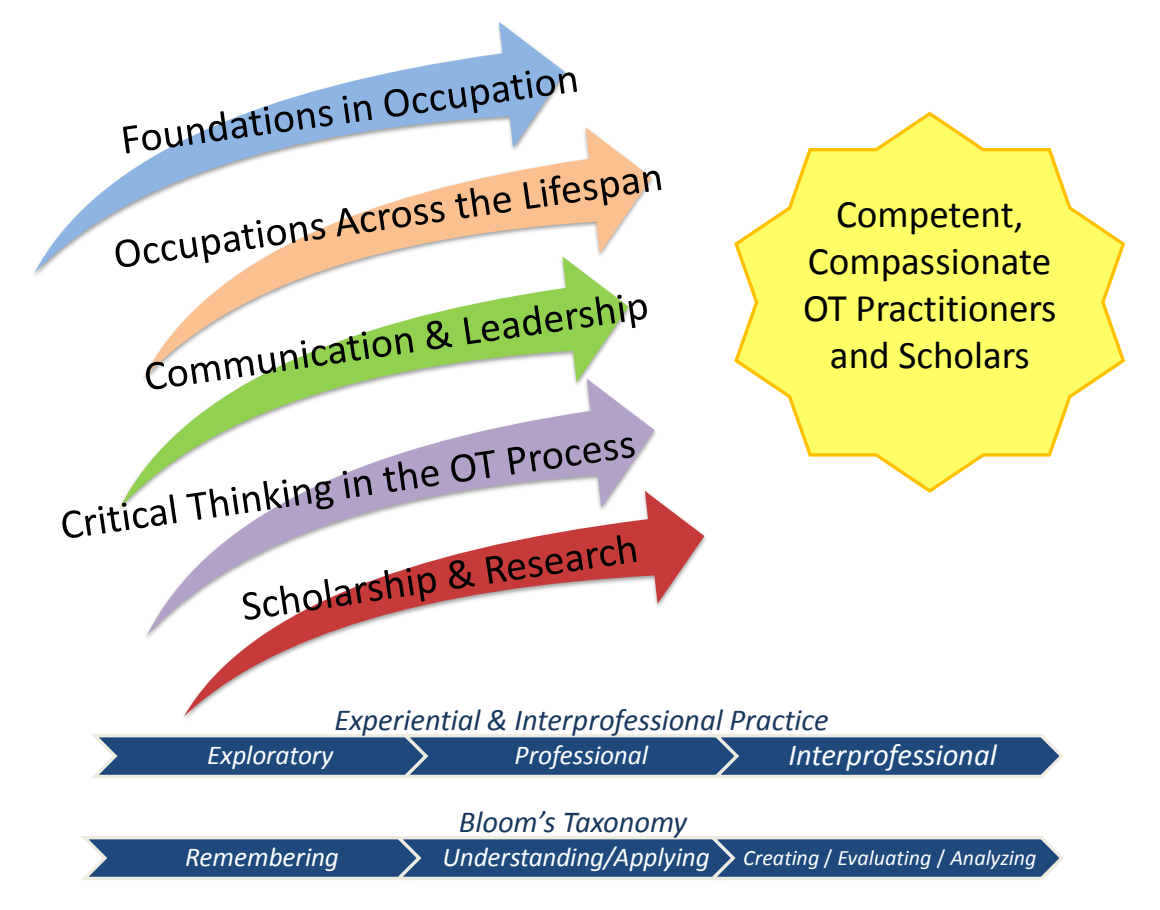
FIGURE 2: CURRICULUM MODEL

The curriculum provides coursework to develop competent, compassionate OT practitioners and scholars. Students engage in experiential and inter-professional practice throughout the curriculum. Practical experiences and fieldwork facilitate the integration of course content.