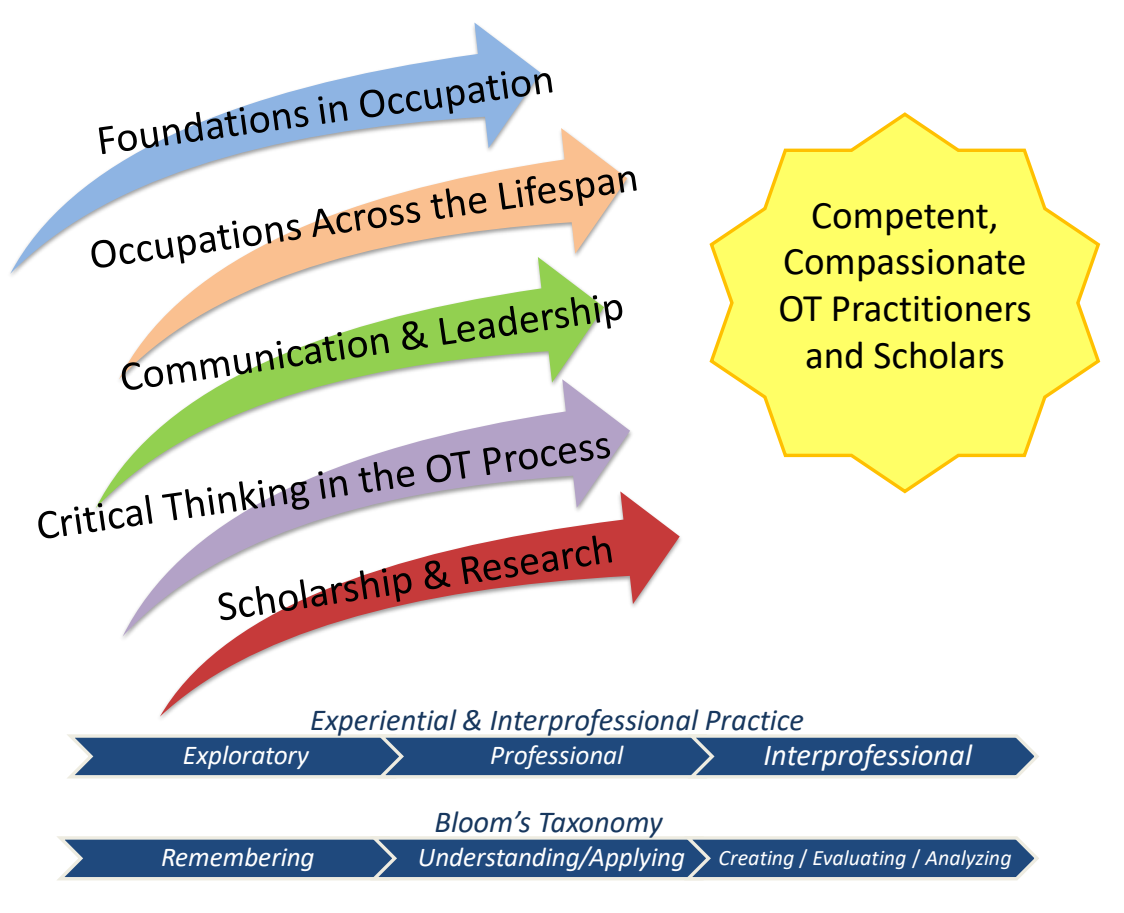
Figure 2: Curriculum Model

The curriculum provides coursework to develop competent, compassionate OT practitioners and scholars. Students engage in experiential and inter-professional practice throughout the curriculum. Practical experiences and fieldwork facilitate the integration of course content. See Figure 3 for curriculum sequence.