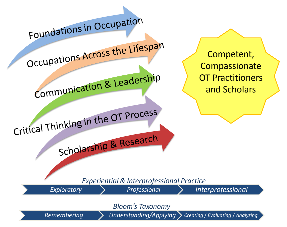
Figure 2: Curriculum Model

The curriculum provides coursework to develop competent, compassionate OT practitioners and scholars. Students engage in experiential and inter-professional practice throughout the curriculum. Practical experiences and fieldwork facilitate the integration of course content.